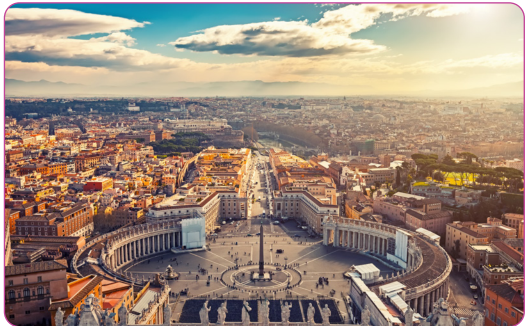
Figure 2.5 The photo shows St. Peter's Square in the Vatican City.