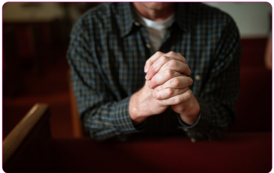
Figure 2.6 A person who is praying.

3. If you do not pray, do you understand why others do? What would you like to ask them?