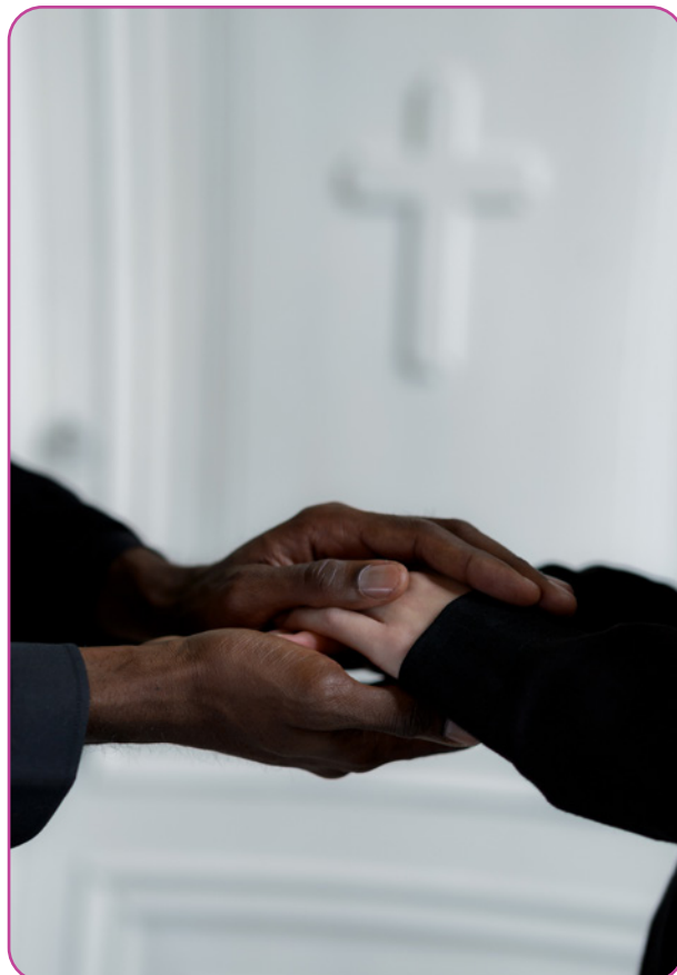
Figure 2.2 Catholic believers find closeness with each other, the Church community, and God.

2. What information about the Catholic faith is new to you?