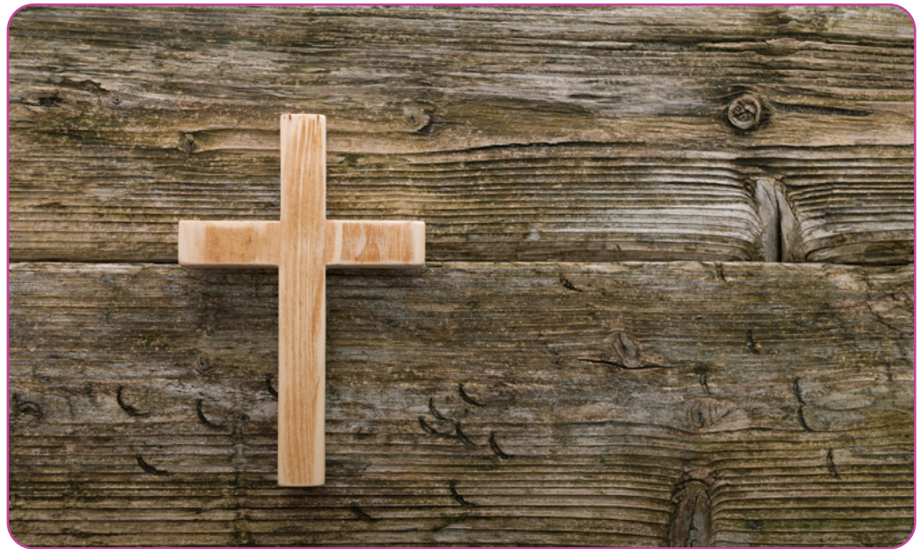
Figure 2.4 A cross is one of the most important symbols for Catholics.

2. A Catholic pilgrim is a traveller who is on a journey to a place of religious significance. Catholics can choose to go on pilgrimages to places connected to saints, such as Lourdes.