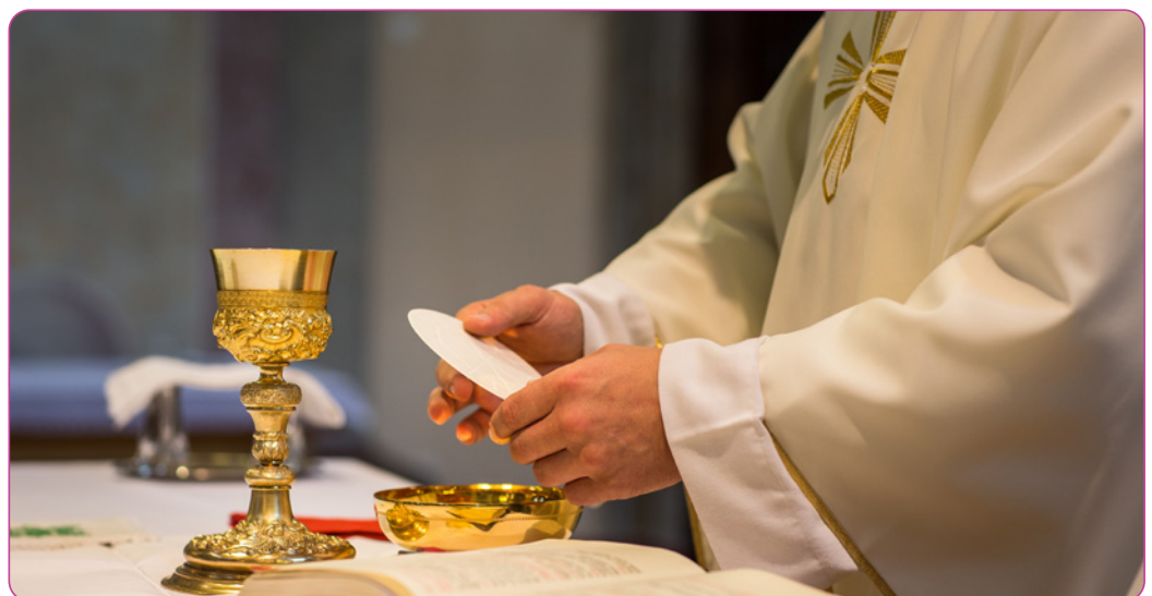
Figure 2.3 The moment of the Eucharist during Mass.