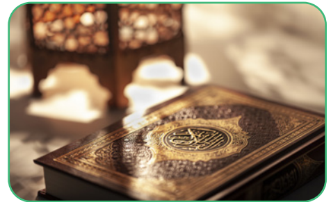
Figure 2.2