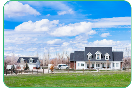
Figure 2.4

Everyone notices what is important to him or her. The students think food is important because they are hungry, so they chose the chicken. A chicken means food to them.