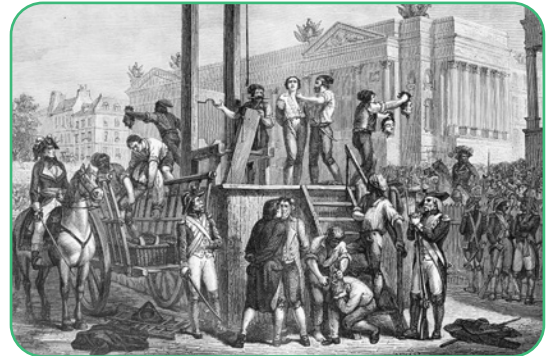
Figure 2.12

So no, it is not the case that “chopping off hands of those who have stolen” is an eternal rule of a firmly chiseled sharia that every Muslim adheres to. When such a rule is pronounced, it concerns only some scholars who in certain contexts concluded that this was a correct rule based on their beliefs about (God-wanted) justice in society. This is little different from, for example, the fact that the legal system in France approved the death penalty through the Guillotine up to the 1970s. It was a rule that arose from old beliefs about justice (wanted by laicity) in society.