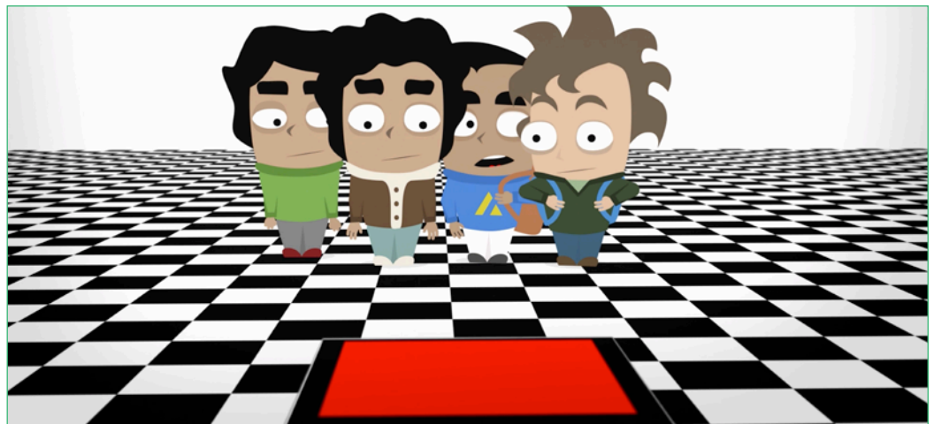
Figure 2.1 Video Clip

Anwar is 16. He becomes discouraged because he cannot find a student job and suspects that it has to do with his Islamic name and place of residence (Molenbeek, Brussels). Shahid try to convince him and he tries to label non-Muslims as the enemy, using the part of a quote from the Quran. He believes that the verse justifies violence against non-Muslims and tries to convince his friends that the verse doesn't need any contextualizing.