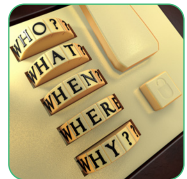
Figure 2.6

The verse: “And kill them wherever you find them, and drive them out where they drove you out” . is revealed in Medina. The verses of Medina are contextually bound. It is important to study the specific context of Medina.