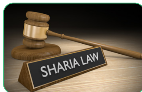
Figure 2.10

Allah’s words are eternal, but every person who interprets Allah’s words is a product of his time. There are thousands of tafsirs and books about the fiqh, everyone has a different interpretation and opinion. All those books are human works and can therefore contain errors contrary to the words of Allah.