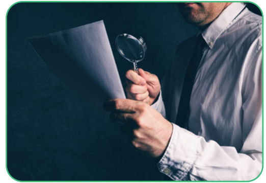
Figure 2.5

These passages took place in the seventh century in the Arabian Peninsula. They tell us about what happened then and in that specific place, about conflicts with specific tribes and persons. They also tell us more about the political actions that the Prophet Mohammed s.a.w. undertook. Every era and every society