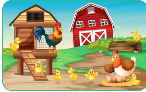
Figure 2.3

This example teaches us that the feelings and background of the students influenced how they experienced the image. The students were hungry (feelings) and they lived in a poor village (the background). They were not familiar with the style of the house represented in the picture.