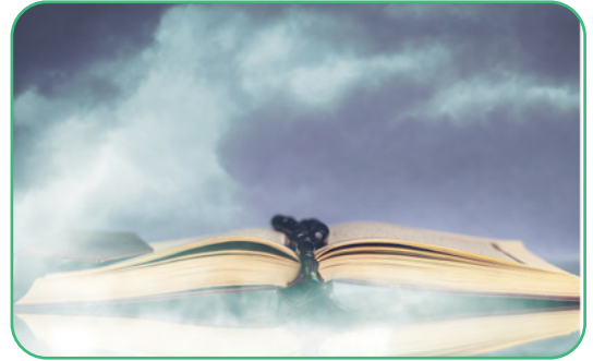
Figure 2.8

The reason for revelation of verse 191 of surat al-Baqara is that the Muslims of Medina agreed on a treaty with the Meccans. There was tension between the different parties. When the Meccans violated the treaty, the Quran gave permission to the Muslims to make war with the Meccans. This allowed the Muslims to defend themselves and protect themselves from destruction.