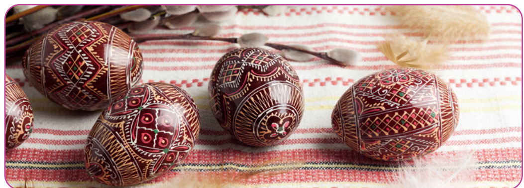
Figure 4.2 Decorated Easter eggs, traditional for Eastern Europe culture

Icons, namely paintings of holy women and men, stories from their lives and our holy book, the Bible, are respected by Orthodox and play an important role in our tradition. They cover the walls of our churches or are painted on pieces of wood. My family has two such icons at home that belong to the family for many generations. They are placed in the small icon corner that is used for prayer in my family house. My mother usually takes care that the oil lamp that hangs in front of them is always burning. Icons are usually called the books of all believers, especially of those who cannot read. They remind us in a simple way of the sacred stories and persons of our faith. Our holy book, though, is the Bible or the Holy Scripture. It consists of two parts, the Old and the New Testament. The Old Testament contains 49 books and the New Testament 27. Passages from them and especially the New Testament are read in our worship. In the Greek Orthodox Church, they are usually read in ancient Greek, which makes it sometimes quite difficult to understand. My aunt, however, gave me a nice translation of the New Testament last year and I have spent some time reading it. It is certainly a fascinating book!