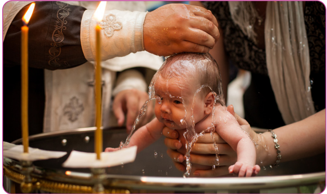
Figure 4.5 Newborn baby baptism in Holy water

Our parish church is very important for our family life not only because of the celebration of great feast and the Divine Liturgy but because some of the most important events of our family life take place there.