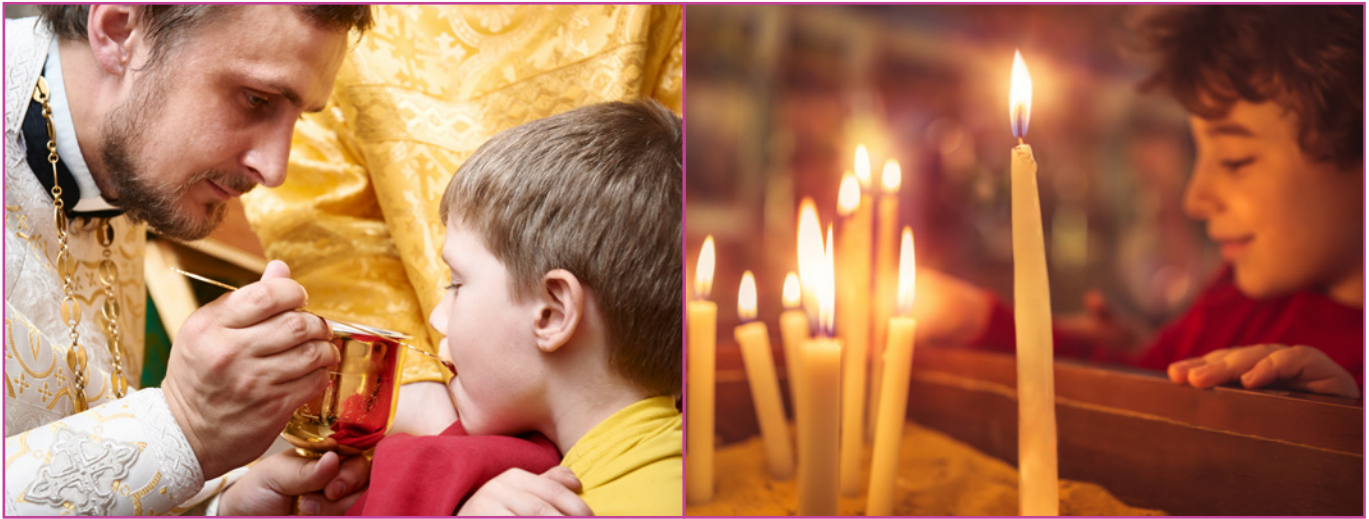
Figure 4.3 Orthodox ceremony of the Eucharist