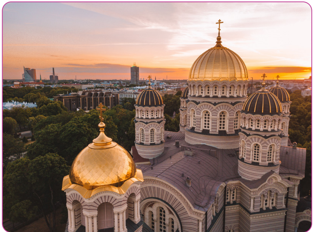
Figure 4.1 Cathedral of the Nativity of Christ in Riga, Latvia