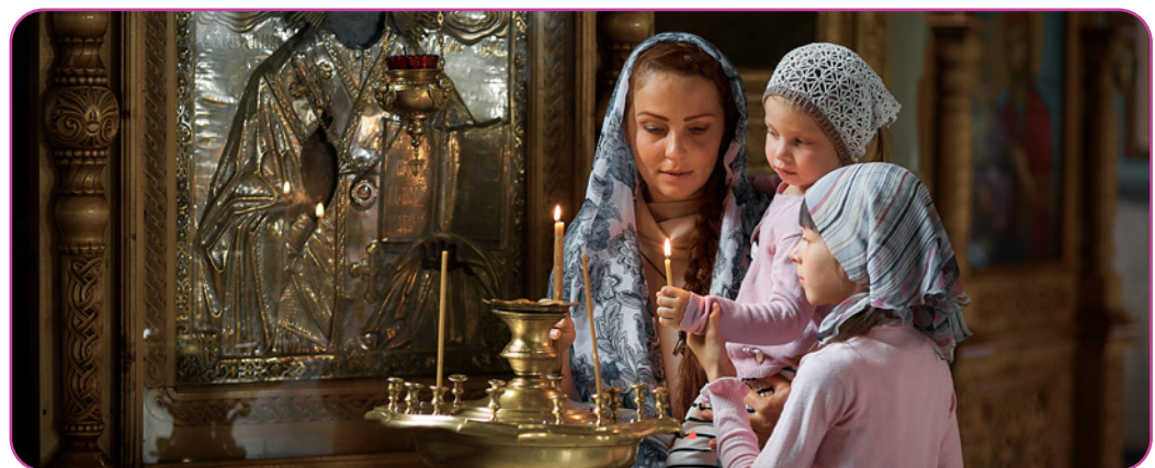
Figure 4.7 Young mother and her little blond Caucasian daughter with candles in Orthodox Russian Church