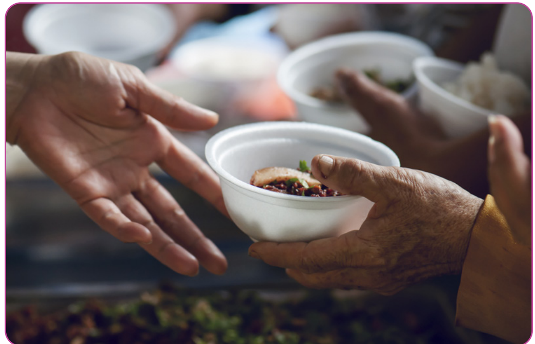
Figure 4.8 Hands of the poor receive food

When hearing the hymn what are the associations that one could make to current situations and challenges?