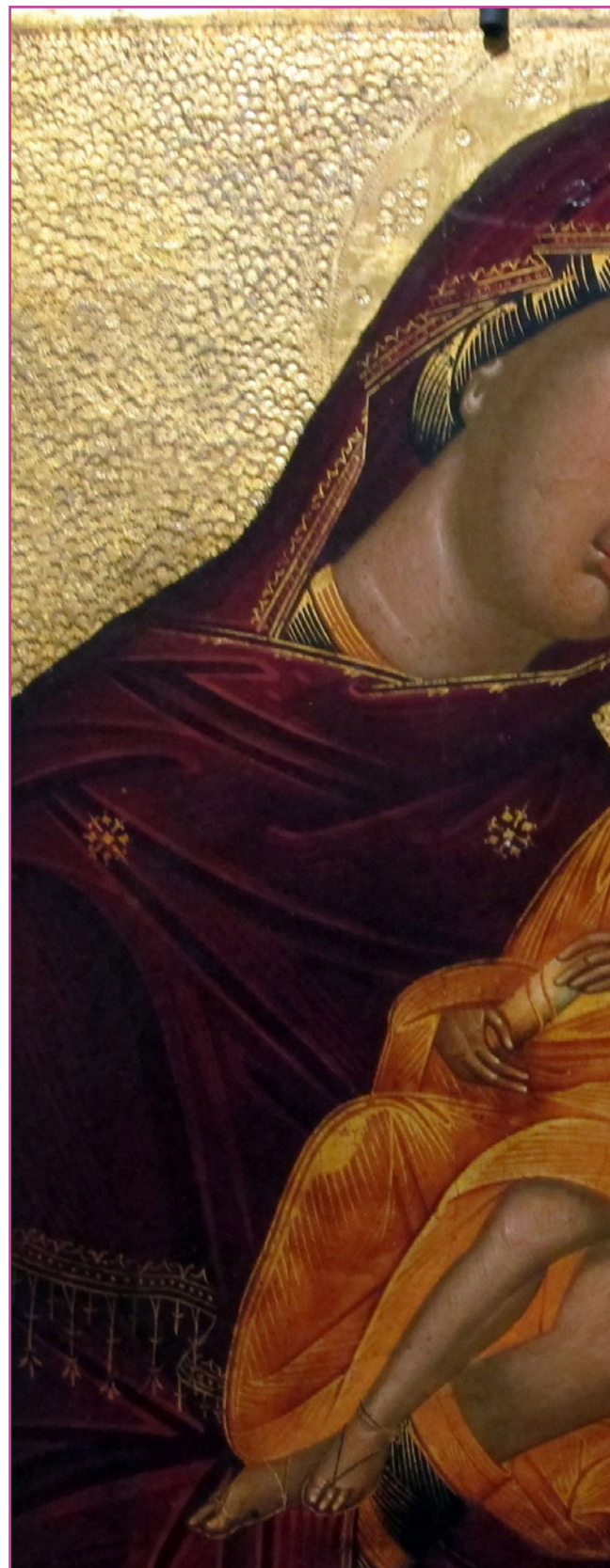
Figure 4.6. The Theotokos in the type of Glykophilousa (kissing the infant Jesus). Genève: "Creta o venezia, madona glykophilousa, 1457.JPG", madonna_glykophilousa_1457.JPG

White: It stands for purity and divinity. This is the colour of garments of the angels and Jesus when the aim is to stress his divine nature as the Son of God