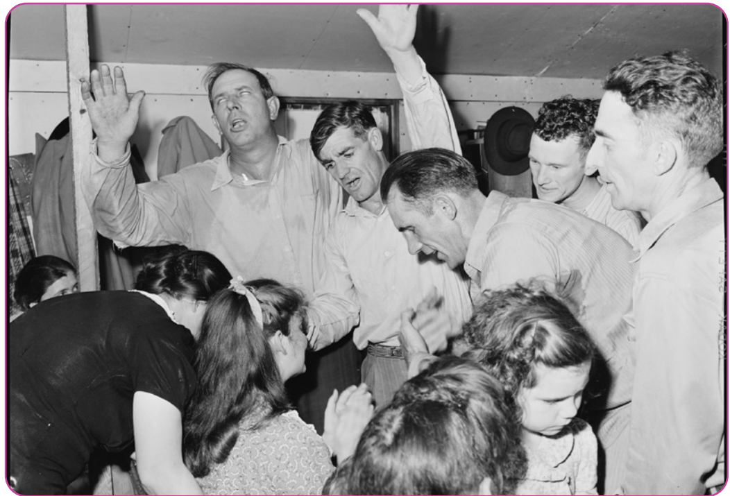
Figure 5.9 Laying on of Hand in the Church of God in Lejunior Kentucky on 9 May 1946

An important concept to talk about is supernatural . It refers to everything that does not fit into our common perception of the laws of nature. This is a very important concept in the Pentecostal movement. Below is a black and white photo of people praying for divine healing for a woman in a wheelchair. Not all Protestants necessarily believe in God working in supernatural ways. Some may believe that the miracles in the Bible were supernatural, but do not believe that supernatural events occur in our time.