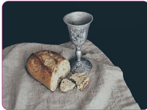
Figure 5.4 Lord's supper symbols

Another element in our services we consider important is the Lord's Supper. In some churches, this is even more important than the sermon. In my church, we celebrate this once a month during a church service. The Lord's Supper involves remembering what Jesus did for us and consists of eating bread and drinking wine. The bread represents the body of Jesus and the wine the blood of Jesus. Jesus himself said that his followers should do this regularly to remember him. By consuming bread and wine, we remember that Jesus died to save us.