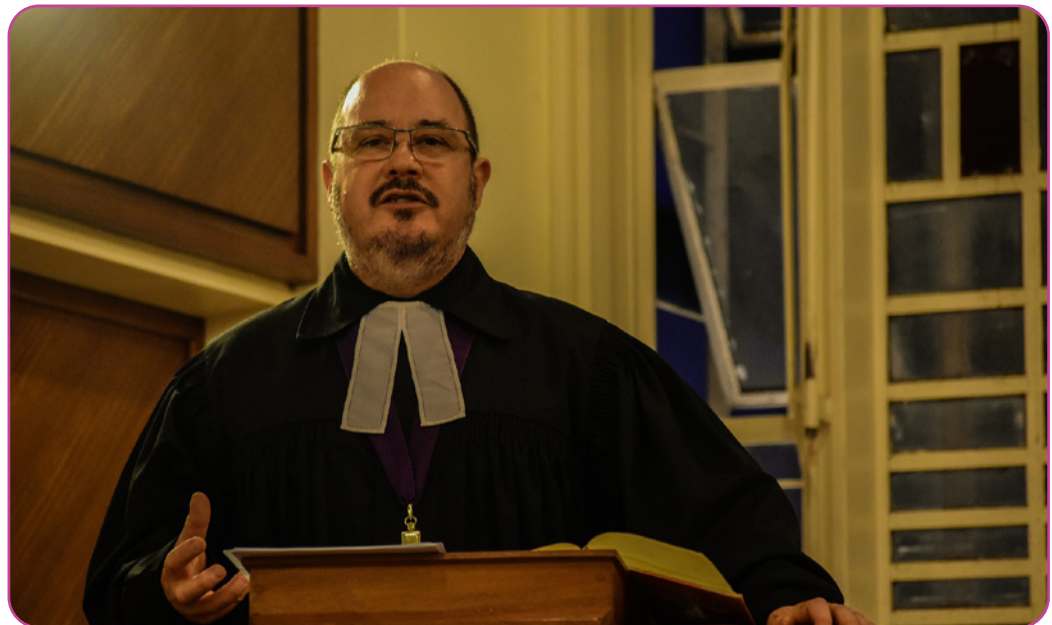
Figure 5.3 Protestant pastor

The pastors in our church are always men. Women are not allowed to become a pastor and therefore cannot lead a church service. My father says this is what the Bible teaches us. In our church, there was a discussion about this three years ago and it was decided not to change anything about it. My sister was one of those who disagreed. She therefore went to another church. According to her, it is not at all in the Bible that women should never preach. She also thinks that this belief is outdated.