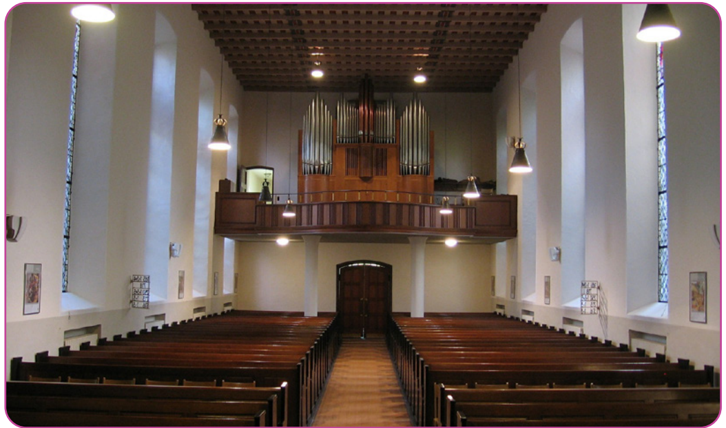
Figure 5.1 Interior of a Lutheran Church with an organ.