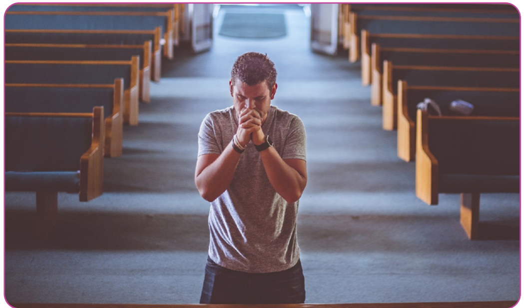
Figure 5.8 Man praying in an empty church.

What does faith or searching for meaning in life look like for you?