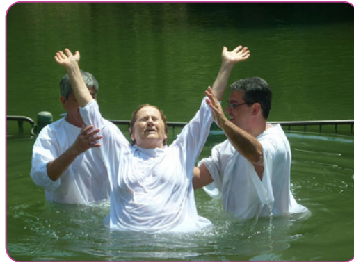
Figure 5.7 Infant baptism in a Church (right)