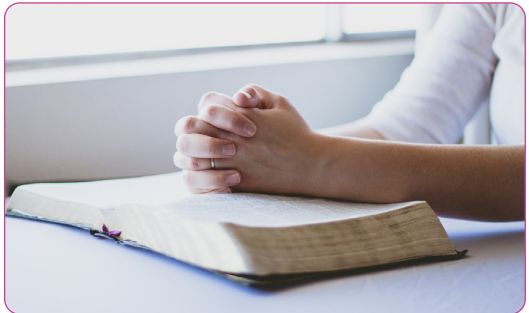
Figure 5.2 Bible and folded hands as a sign of praying.

What we believe about Jesus comes from what we find in the Bible, which is a holy book to us. For this reason, we read a section of the Bible at dinner every day. My parents also go to church for a Bible study every week. There, they reflect on the Bible together with others. When they encounter a problem in life, they often seek for guidance in the Bible, because they believe the Bible is the word of God. My sister disagrees with this. According to her, the Bible is just a book of humans, but it may serve as a valuable source of inspiration for life.