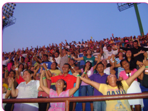
Figure 5.5 Pentecostal youth worshipping God during a youth congress in Mexico.

During a vacation in South America with my uncle and aunt, we visited a church that was nothing like ours. There was a lot more singing and a lot of dancing. They also spoke in a strange language. My uncle called it "speaking in tongues." They also prayed for people while laying hands on them. My uncle told me this is a Pentecostal church. He said that Pentecostals consider it important to listen to the Holy Spirit. The Holy Spirit is the power of God who works through people. Protestants believe with other Christians that there is one God, but he exists of three persons, Father, Son and Holy Spirit. I don't understand this well, but it is called 'the Trinity.'